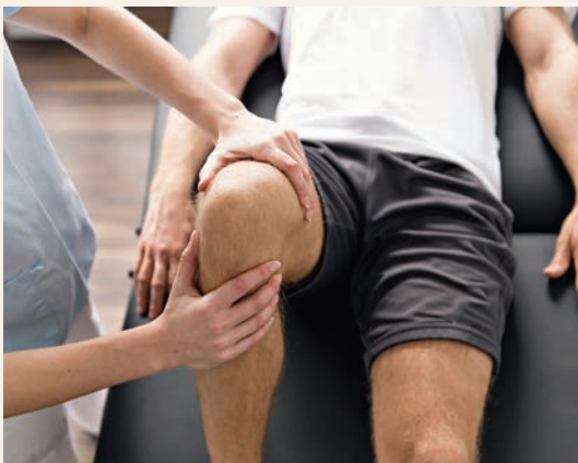
ADOBE STOCK PHOTOGRAPHY